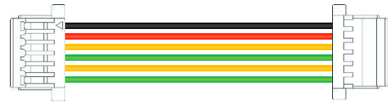
JST-SH 6-pin 195mm Cable x 1