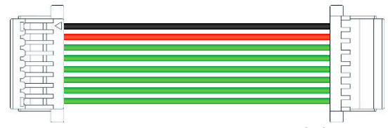
JST-SH 8-pin 35mm Cable x 2